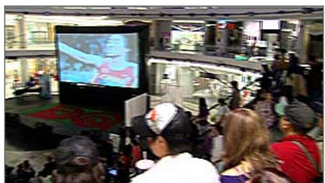
The crowd for the Olympic opening ceremony filled all floors of the Aberdeen mall in Richmond, a popular shopping spot for the city's large Chinese-Canadian community.

Five thousand people filled the Aberdeen mall in Richmond to watch as what some have called the most elaborate launch in the history of the Olympic Games was broadcast live during the early morning hours on a giant screen.