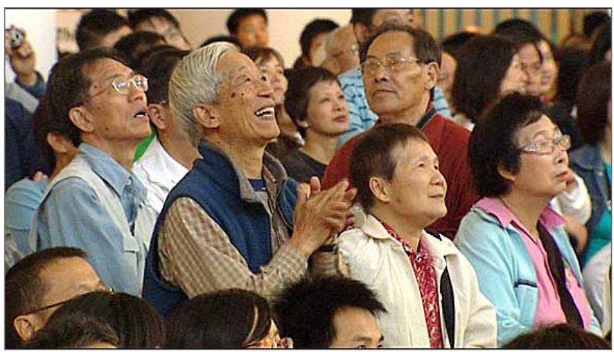
An estimated 5,000 people turned up early Friday morning at the Aberdeen mall in Richmond to watch the opening ceremony of the 2008 Olympic Games in Beijing broadcast on a giant screen.

Last Updated: Friday, August 8, 2008 | 8:20 PM ET Comments 12 Recommend 3 CBC News