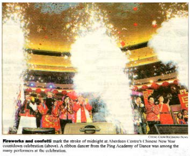
Fireworks and confetti mark the stroke of midnight at Aberdeen Centre's Chinese New Year countdown celebration (above). A ribbon dancer from the Ping Academy of Dance was among the many performers at the celebration.