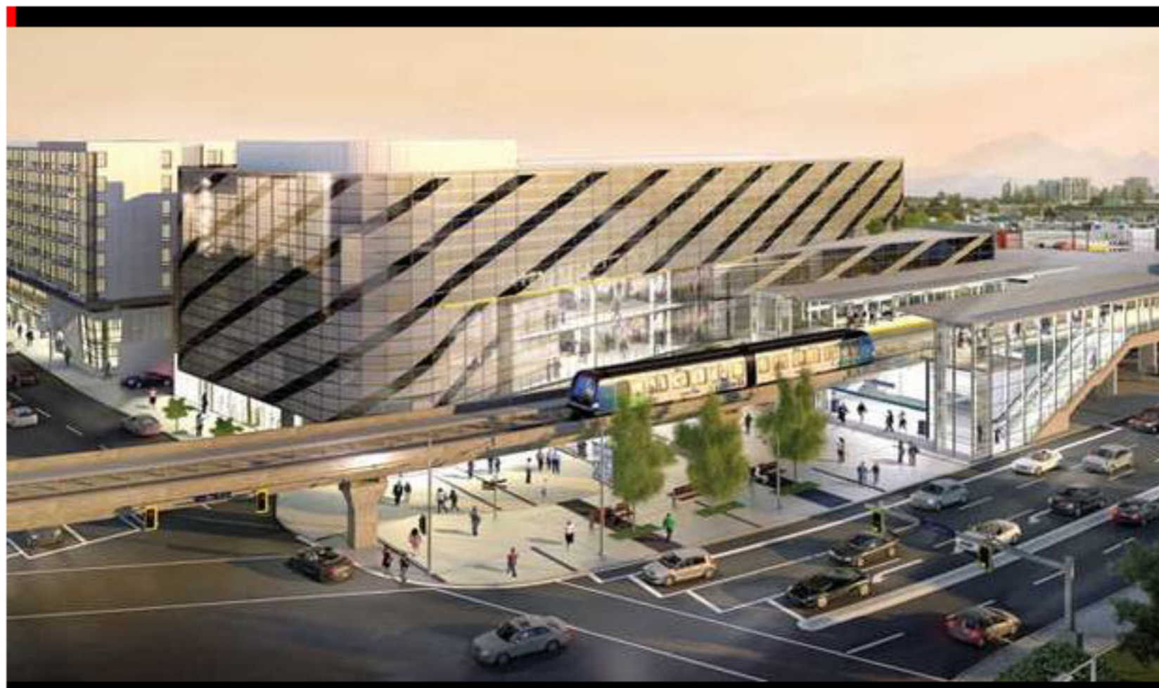
Aberdeen Square is a 160,000-square-foot retail and office space addition to the Aberdeen Centre in Richmond, B.C.

Retail condo units allow small tenants to co-exist next to larger, anchor tenants. Developers hope the new mix will distinguish their malls from competitors