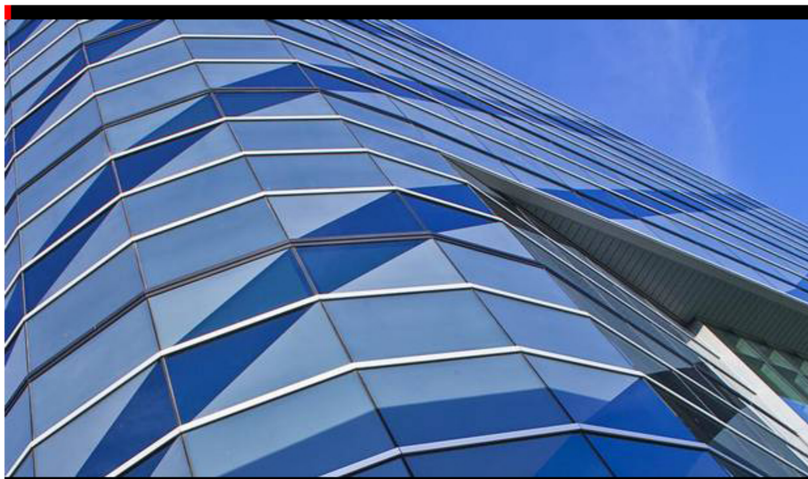
Investors from mainland China snapped up 95 per cent of the retail condo units that were offered for sale, with many buyers taking more than one unit. Investors like the property's connection to Metro Vancouver's Canada Line rapid transit system. (Aberdeen Square)