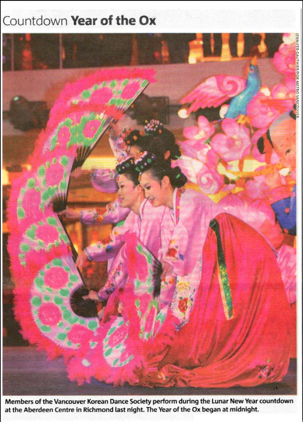
Members of the Vancouver Korean Dance Society perform during the Lunar New Year countdown at the Aberdeen Centre in Richmond last night. The Year of the Ox began at midnight.